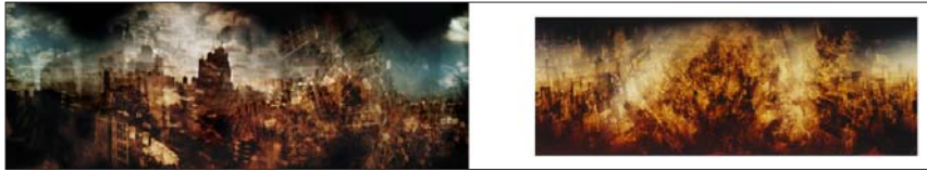
52. NEW YORK