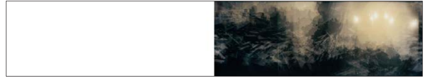
21. NEW YORK