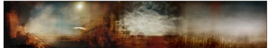
38-39. STOCKHOLM/NEW YORK/LOS ANGELES/HONG KONG