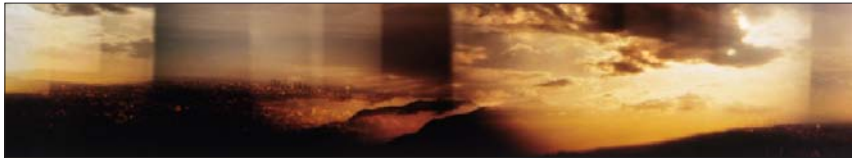
34-35. LOS ANGELES