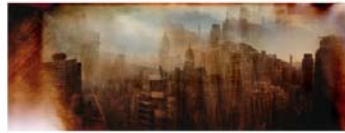
11. HONG KONG