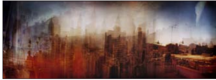
I. LOS ANGELES/HONG KONG/BOMBAY