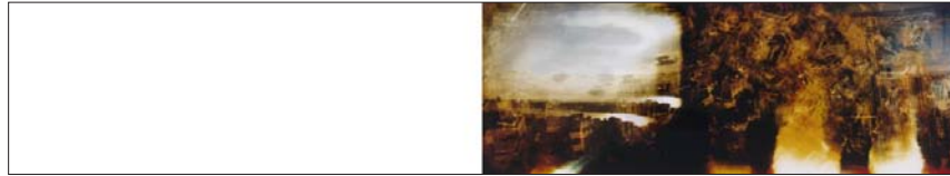
55. NEW YORK