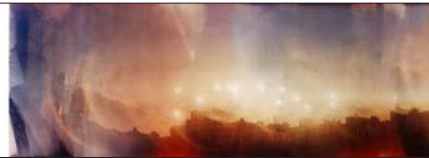
37. NEW YORK