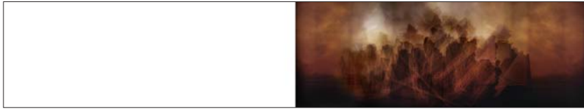
47. HONG KONG