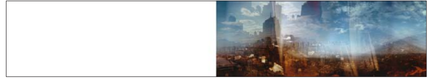
9. NEW YORK/LOS ANGELES