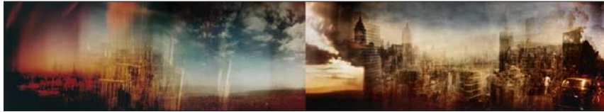
16-17. STOCKHOLM/NEW YORK/LOS ANGELES/HONG KONG/BOMBAY