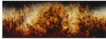
53. NEW YORK