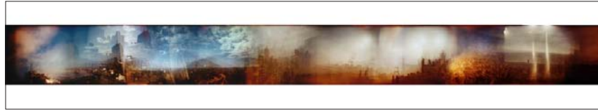
6-7. STOCKHOLM/NEW YORK/LOS ANGELES/HONG KONG/BOMBAY/DUBAI/PARIS/STOCKHOLM