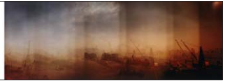
33. HONG KONG